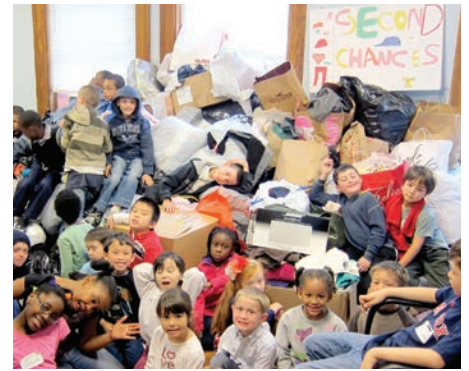
Some of our youngest volunteers involved their entire congregation in a clothing drive through their Sunday School. We're so proud of these compassionate kids!