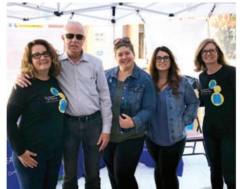
We look forward to a time when we can have in-person volunteer opportunities again. Until then, we hope you'll consider some of these options.