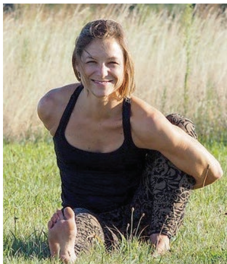
Visit Theresa Briggs Yoga at theresabriggsyoga.com for the current virtual yoga schedule.