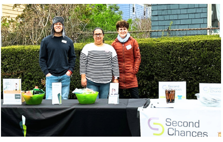
Our Earth Day event at Naveo Credit Union in Somerville was lots of fun, thanks to terrific volunteers from our community. Our work would not be possible without more than 50 volunteers each year.

Learn more and get in touch about volunteering or other ways to support people in our community at secondchances.org/waysyoucanhelp